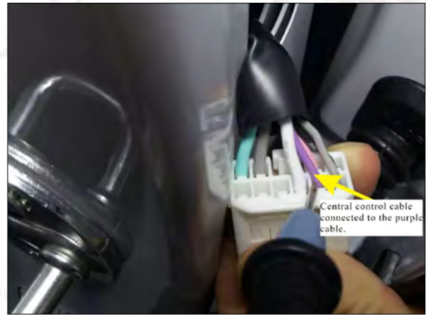
10. The central control cable is connected to the purple cable (The first fifth row from the left to the right).