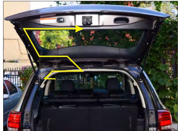
11. The power cable and the central control cable follow the yellow arrow through the rubber plug until the tailgate cover.