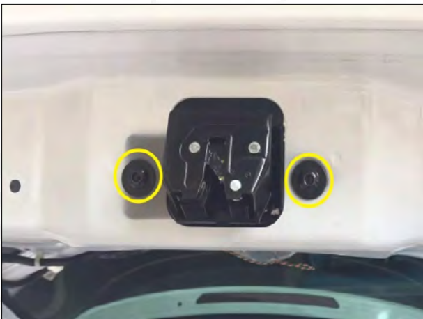
12. Remove the original car screw, remove the door lock, install our suction lock and fix it with the original car screws.