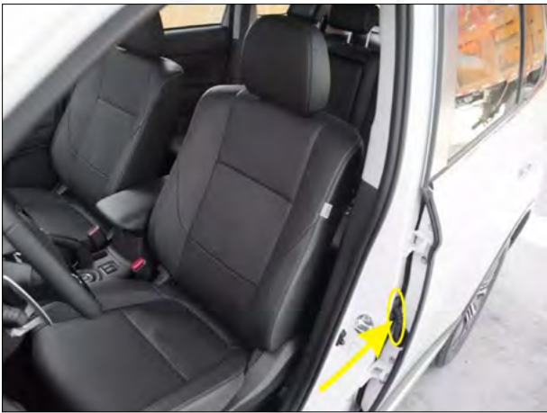
9. Disassemble the rubber plug at the main driving belt B-pillar to find the central control cable.